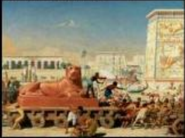
THE ISRAELITES ARE OPPRESSED