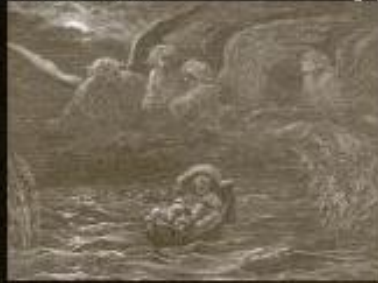
THE BIRTH OF MOSES